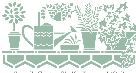
Stencil: Garden Shelf - Trompe L'Oeil