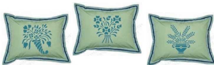
Stencils: Flower Cone, Bouquet & Lavender - botanicals

Optional: Stencil spray adhesive Permanent fine & medium tip markers Permanent paint pens Small watercolor brush