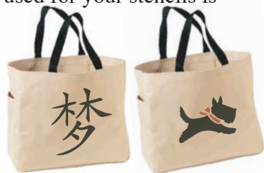
Stencils: Scotty Dog #2 & Dream Kanji

Stenciling works well on wood, paper, primed canvas, natural fabric, walls and wood floors. Home decorating projects include stenciled lamp shades, floor cloths, table runners, painted furniture, kitchen cupboards and curtains to name a few. We have added pictures to offer an idea of ways to use our stencils. You will need the same basic supplies for all stencil projects. Be sure the paint used for your stencils is compatible with the surface to be stenciled. There are many good stencil paints available at craft and hobby shops. Cream stencil paint is easy to use. Acrylic paint has almost unlimited color choices. Laytex wall paint works well for stenciling too. All of these paints dry quickly. Be sure to begin with a clean surface.