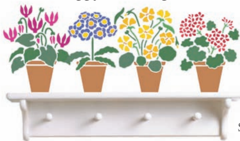
Stencils: Cyclamen Pot, Primrose Pot, Nasturtium Pot & Geranium Pot - botanicals

The most important key to successful stenciling is to use a very small amount of paint when loading the brush. Excess paint will seep under your stencil. For happy stenciling, less is more.